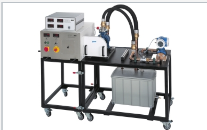
Functional experimental setup: HM 365 drive unit (left), HM 365.10 with pump to be examined (right)