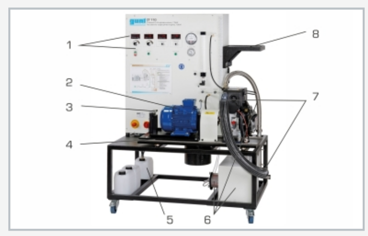
1 display and control panel, 2 asynchronous motor, 3 force sensor (torque), 4 base plate, 5 fuel tank with pump, 6 stabilisation tank with air filter and air hose, 7 exhaust gas connection, 8 shelf, e.g. for CT 100.13