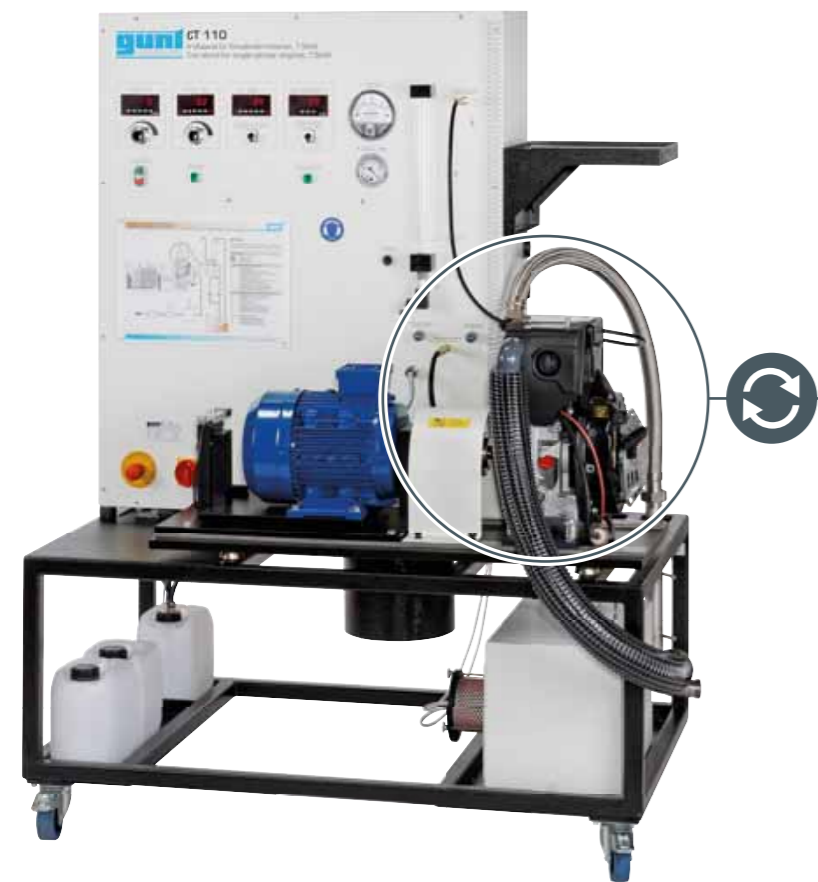
CT 110 Test stand for single-cylinder engines, 7,5kW

The test stand can be operated in normal laboratory facilities. The engine and asynchronous motor are mounted on a single vibration-insulated frame. Intake sound absorption reduces noise. The exhaust gases are vented externally via a hose.