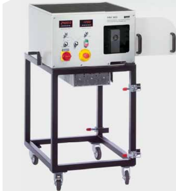
HM 365 Universal drive and brake unit