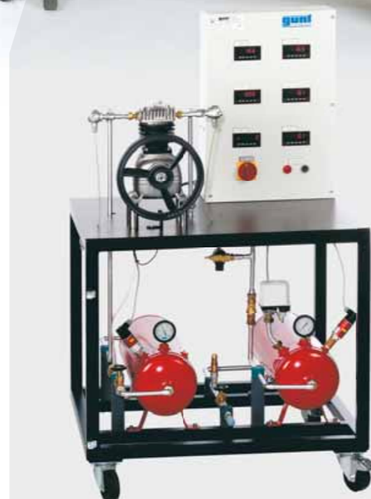
ET 513 Single-stage piston compressor

Piston compressors deliver compressible media such as gas or air.