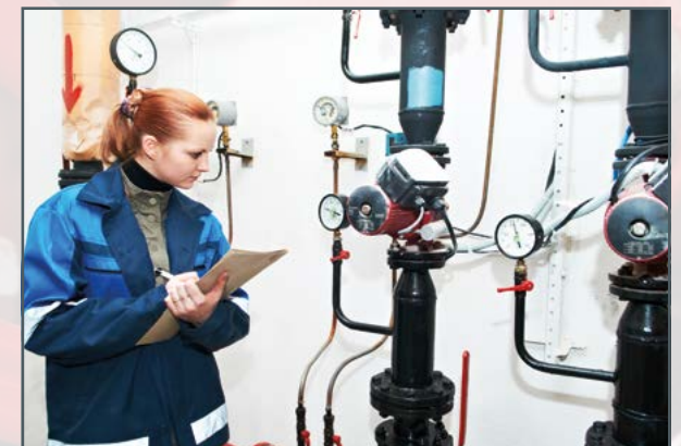
Checking the system components